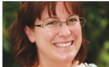
Feature Graduate transition programs