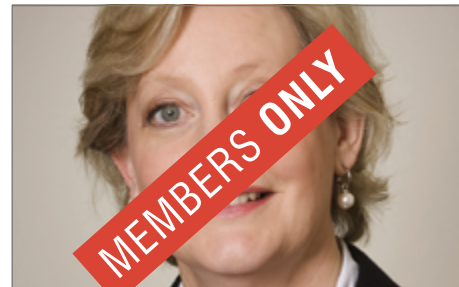
Representation National aged care reforms