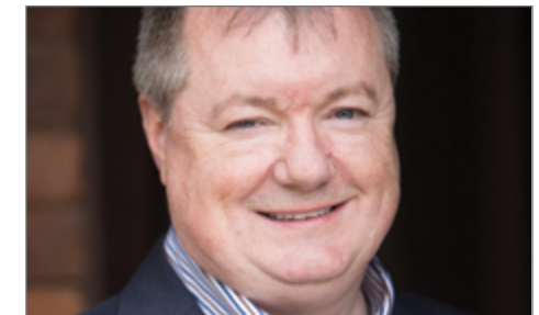
Events The National Nursing Forum