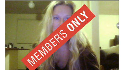
Special feature Member profile: A multi-skilled enrolled nurse