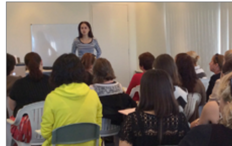
ENL update The latest news from our ENLs