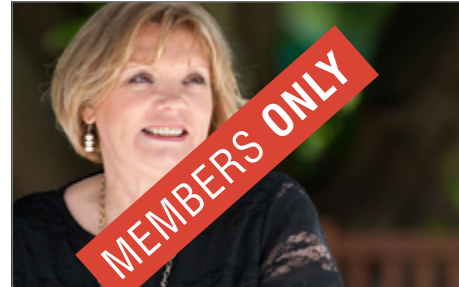
Special feature: Review of the National Competency Standards for Enrolled Nurses