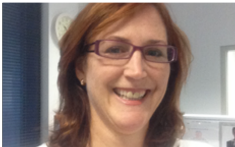
Member engagement: Movement Disorder and Parkinson's COI update